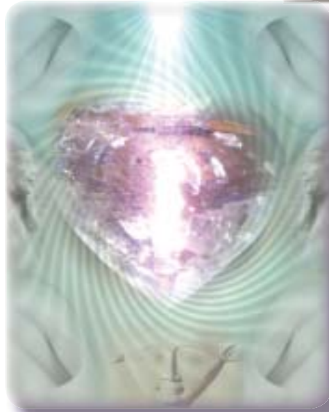
Above a hologram of the energies of the Conclave of the Radiant Heart